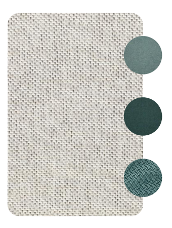
TC NEBBIA 2